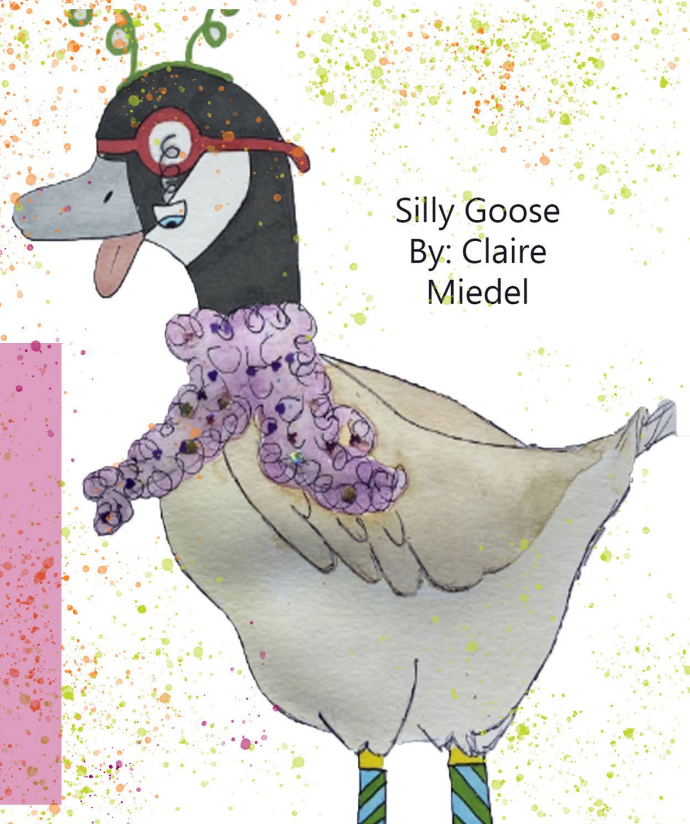
Silly Goose By: Claire Miedel

For current NAHS and NJAHS students and anyone interested in joining!