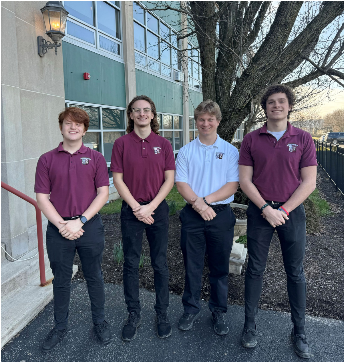
AP Art History and AP Art and Design students travel to the Warhol Museum for a tour and studio time. Thank you to the Warhol for the generous scholarship