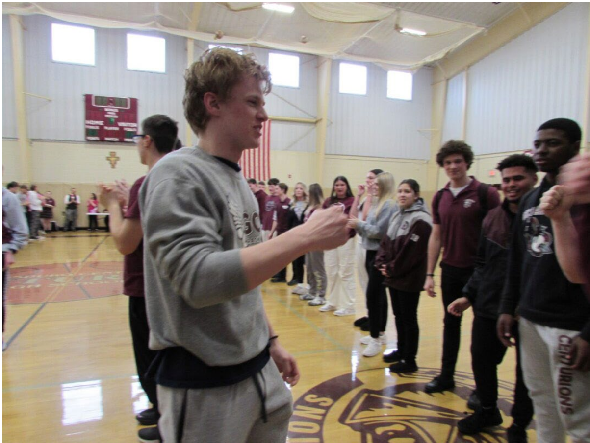
GCC Seniors enjoyed a great field trip today to Saint Vincent College!