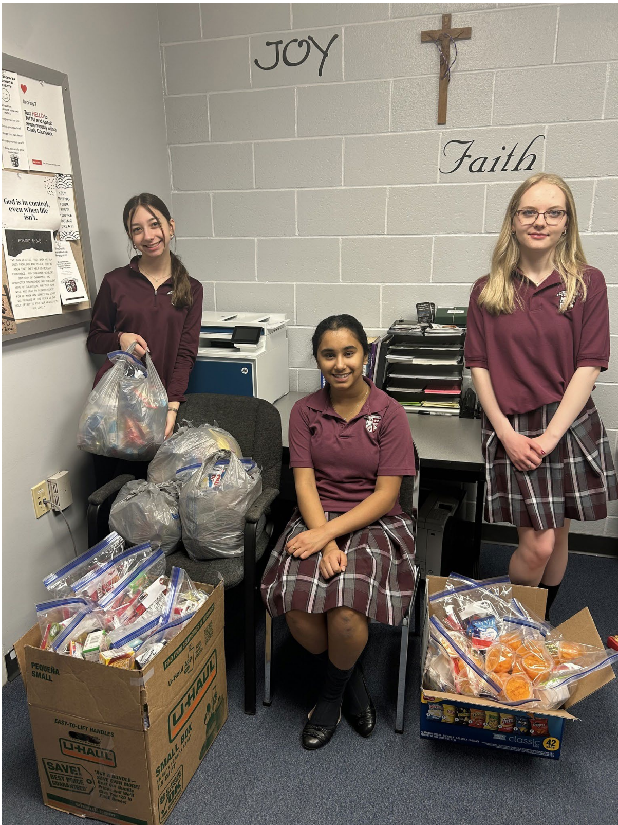
On Wednesday March 27 we celebrated Tenebrae as a school community.