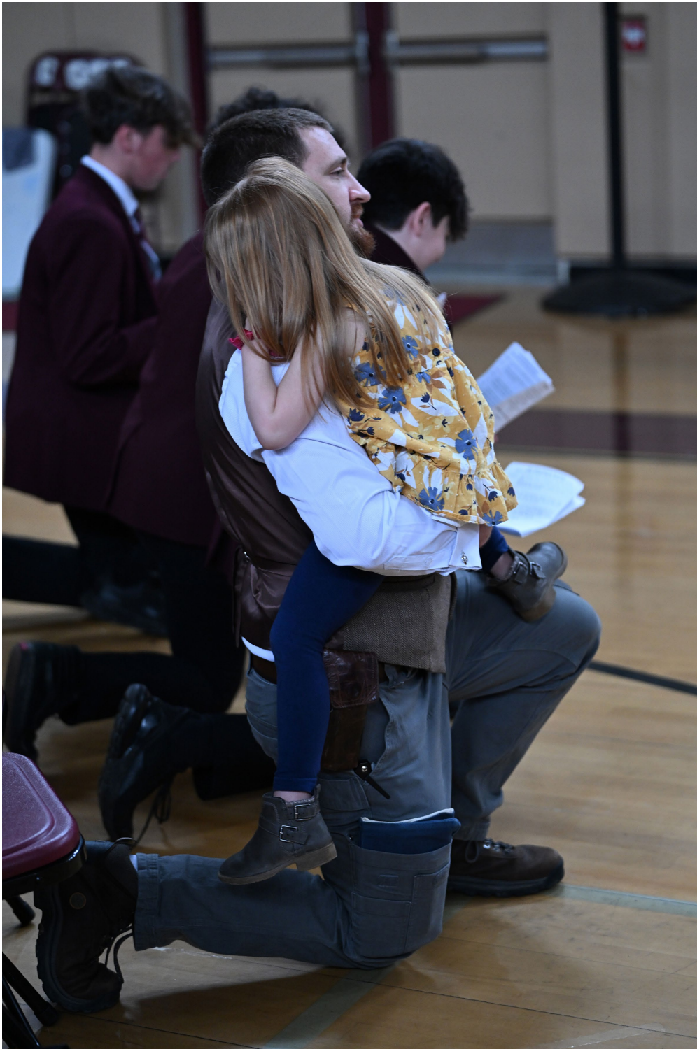
Several of our Interact Officers and Club Members attended the World Affairs Council in Pittsburgh. Discussing topics of Climate and Sustainability.