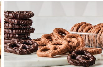
PRETZELS, SNACKS & MORE