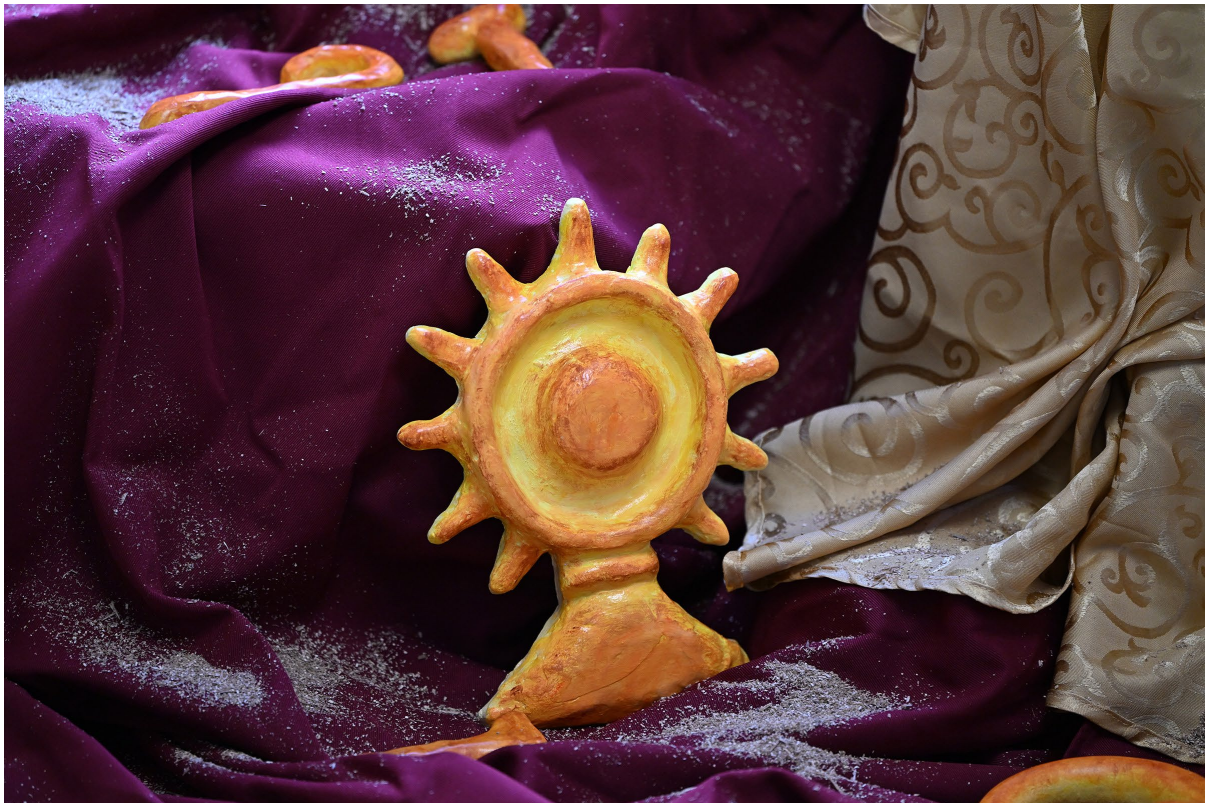
Our community celebrating in prayer the Stations of the Cross