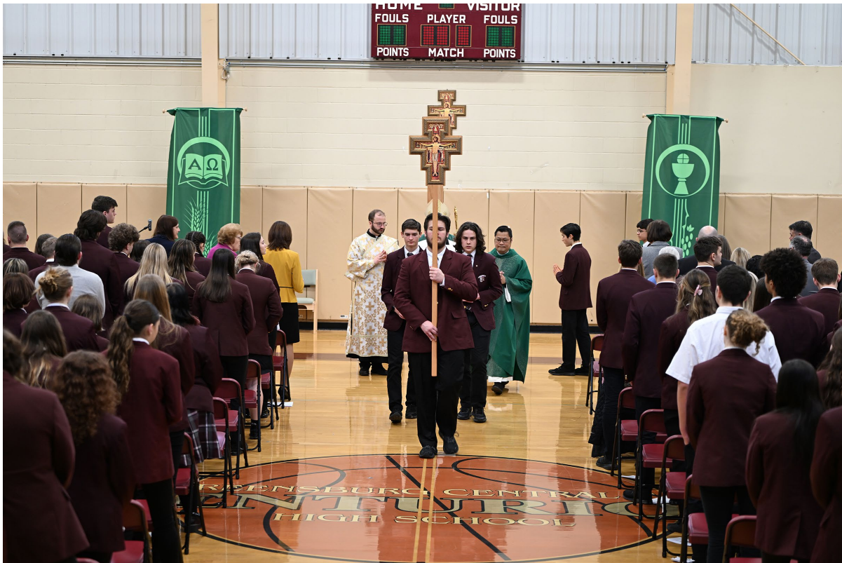
The Student Government delivered cookies today recognizing Catholic Schools Week Faculty and Staff Appreciation Day, and the Squire Roses made cards for the teachers.