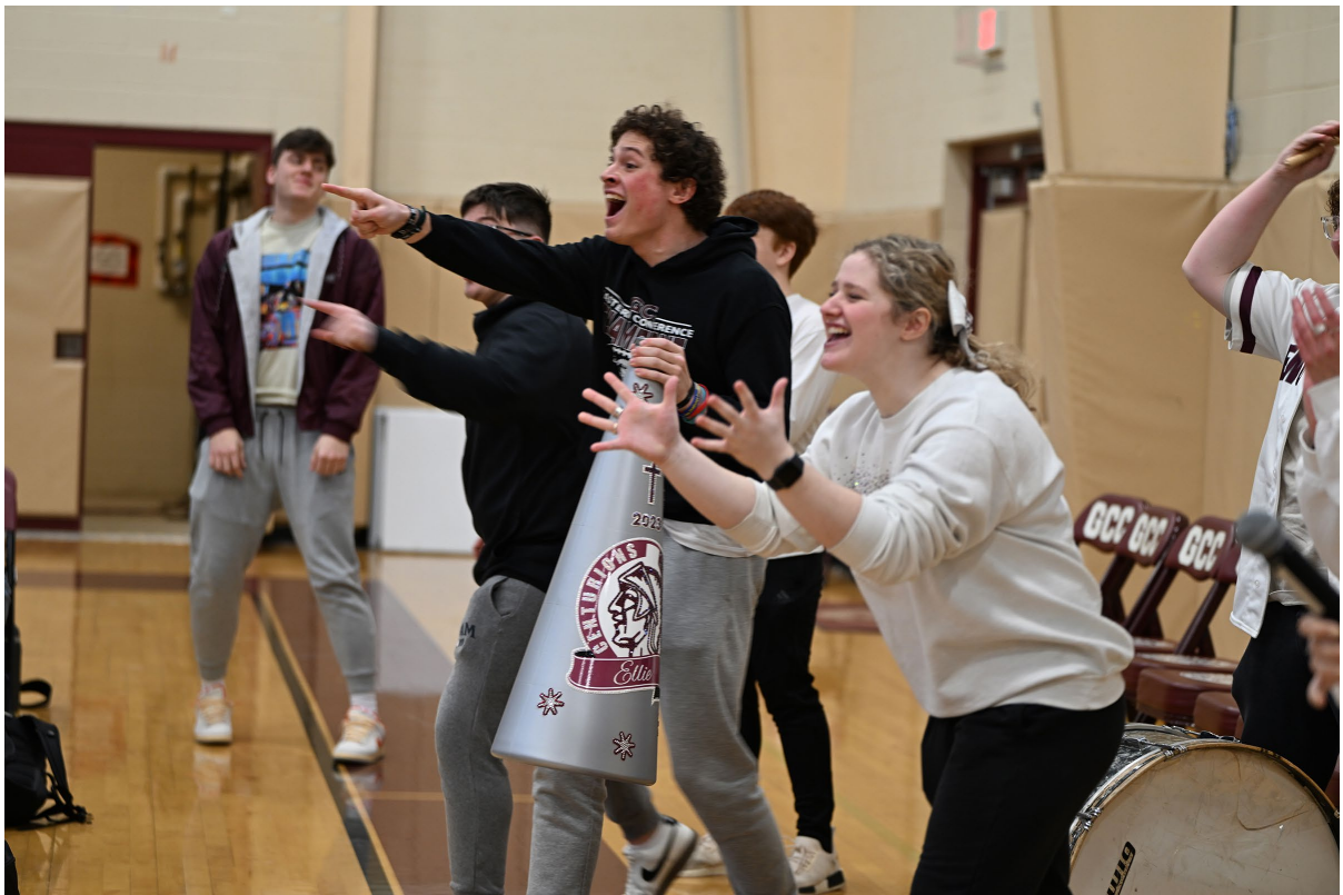
Junior Ring Ceremony and Mass during Catholic Schools Week